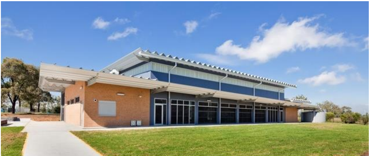
St James Primary school MPC – Skellatar Stock Route

Under the auspices of the NSW Bridge association The ABF has approved the issue of RED Masterpoints at the B4 Level