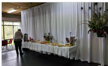
The grazing table.