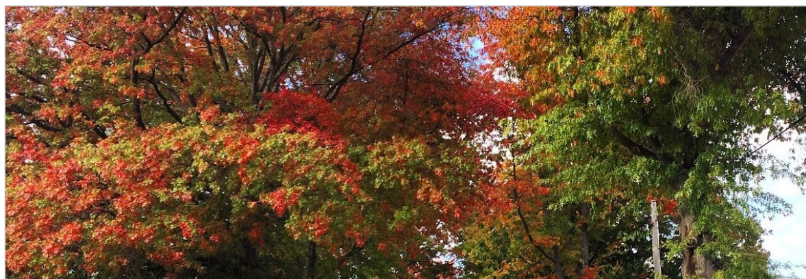
The colours of Tenterfield.

Two excellent meals were provided by the Golf Club restaurant so congress patrons certainly did not go hungry. In fact, the grazing table team commented that they had never seen so many people eat so much constantly while playing cards.