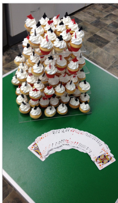
The Cup Cakn Around Long Jetty created the cutest cup cakes specially for this occasion.