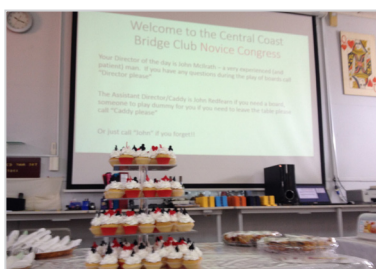
A friendly note and delicious cup cakes welcomed players to a relaxed novice congress.