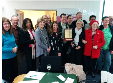
The triumphant Trumps Club crew

The highlight of the day was the opportunity to chat with bridge players across the metro north region.